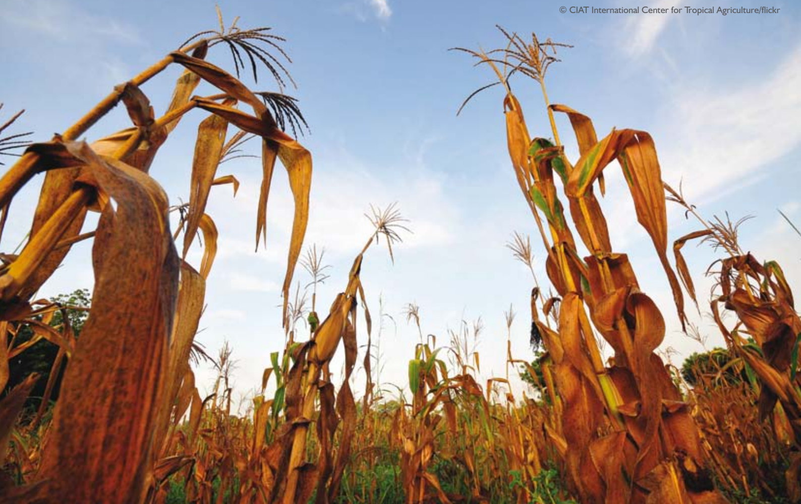
Failed maize crops in Ghana.

The Climate Vulnerable Forum has judged the impacts of climate change on Africa, as well as the risk of future impacts, to vary from 'high' to 'severe' depending on the region; it is the most vulnerable region of the world to climate change after southern Asia. 96 The Climate Vulnerability Monitor estimates that climate change led to 400,000 additional deaths worldwide in 2010, from such causes as natural disasters (floods, landslides, and storms), heat- and cold-related illnesses, diarrhoeal infections, meningitis, malaria and other vector-borne infections, and malnutrition. Of these deaths, 335,000 took place in only 20 highly vulnerable countries – 13 of which are in Africa. Despite this, Africa is currently responsible for less than 4% of the world's greenhouse gas emissions each year. 97 Historically this figure is likely to have been even smaller, meaning that Africa is responsible for a negligible amount of all the greenhouse gases that have built up in the atmosphere over time.