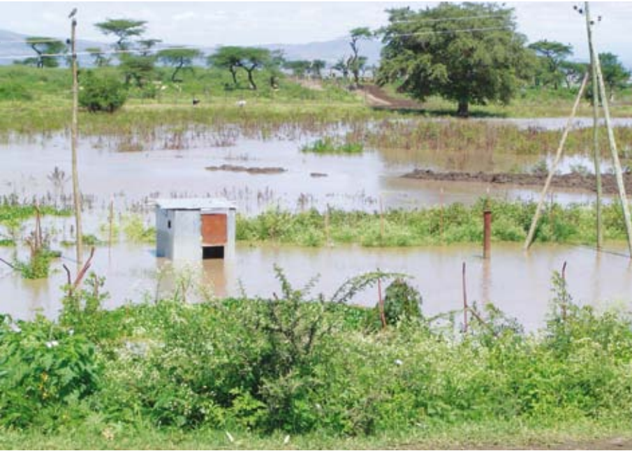
Flooding in Ethiopia