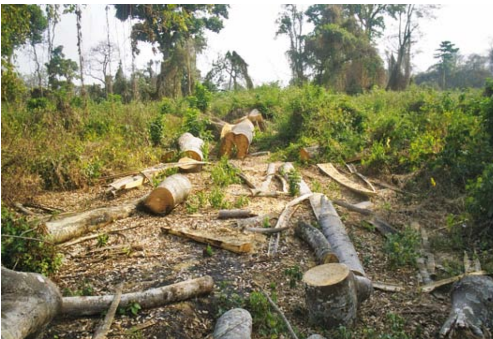
The aftermath of illegal logging in Benin, West Africa.