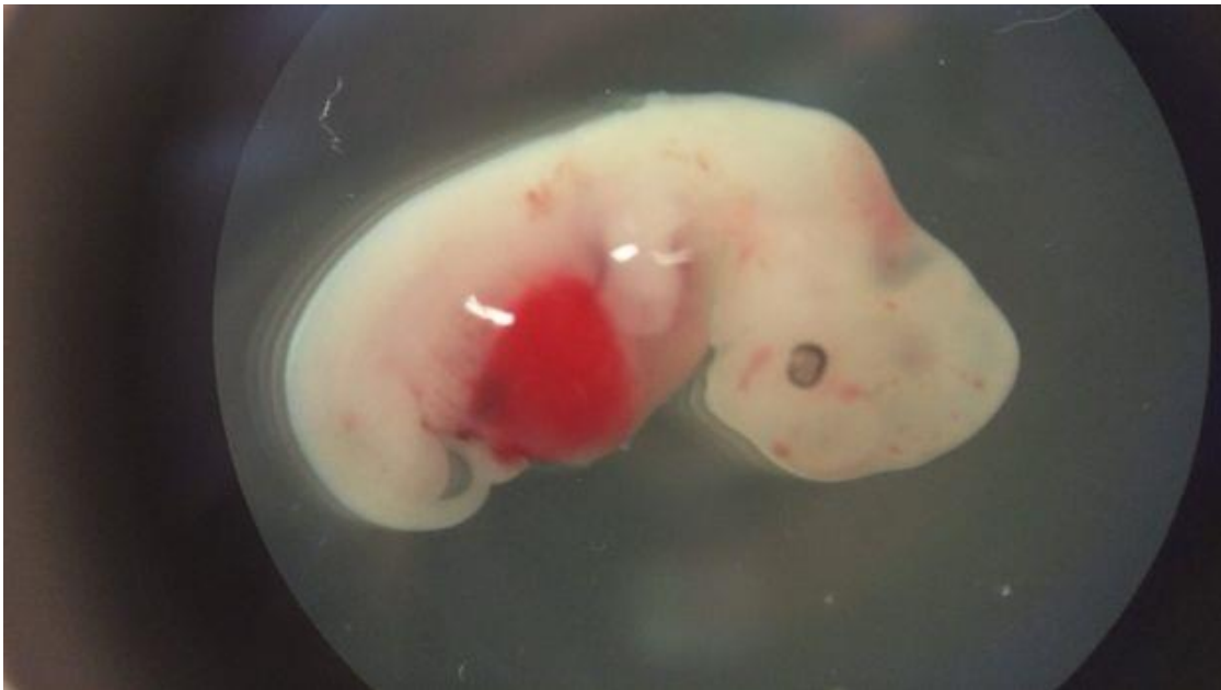
A four-week-old human-pig embryo.