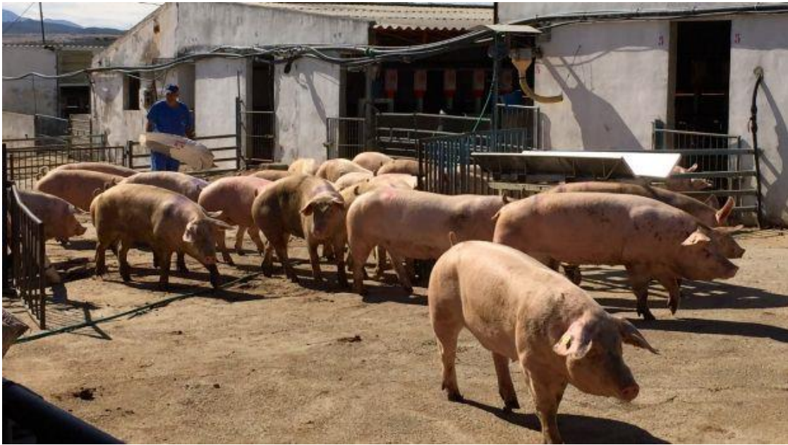
Pigs at the Agropor facility in Spain are being used in the chimera experiments.

Dr Wu said: "We wanted to stop the process early and analyse the results in order to understand the process better. We want to guide the human cells to be the organs we want them to be rather than going randomly everywhere."