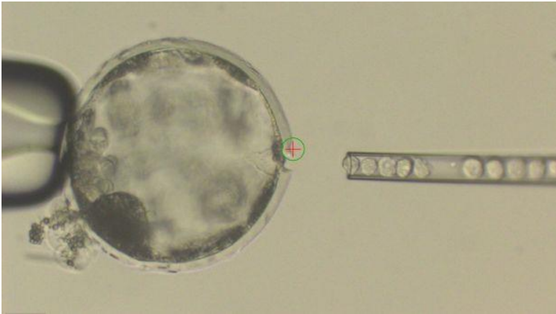
Injection of human stem cells into a pig blastocyst, a precursor to the embryo.